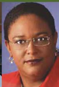
Hon. Mia Mottley Deputy Prime Minister – Barbados