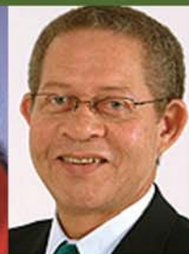
Hon. Bruce Golding Leader of the Opposition Jamaica Labour Party (JLP)