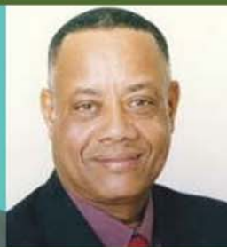
Hon. Derrick Kellier Minister – Labour & Social Security